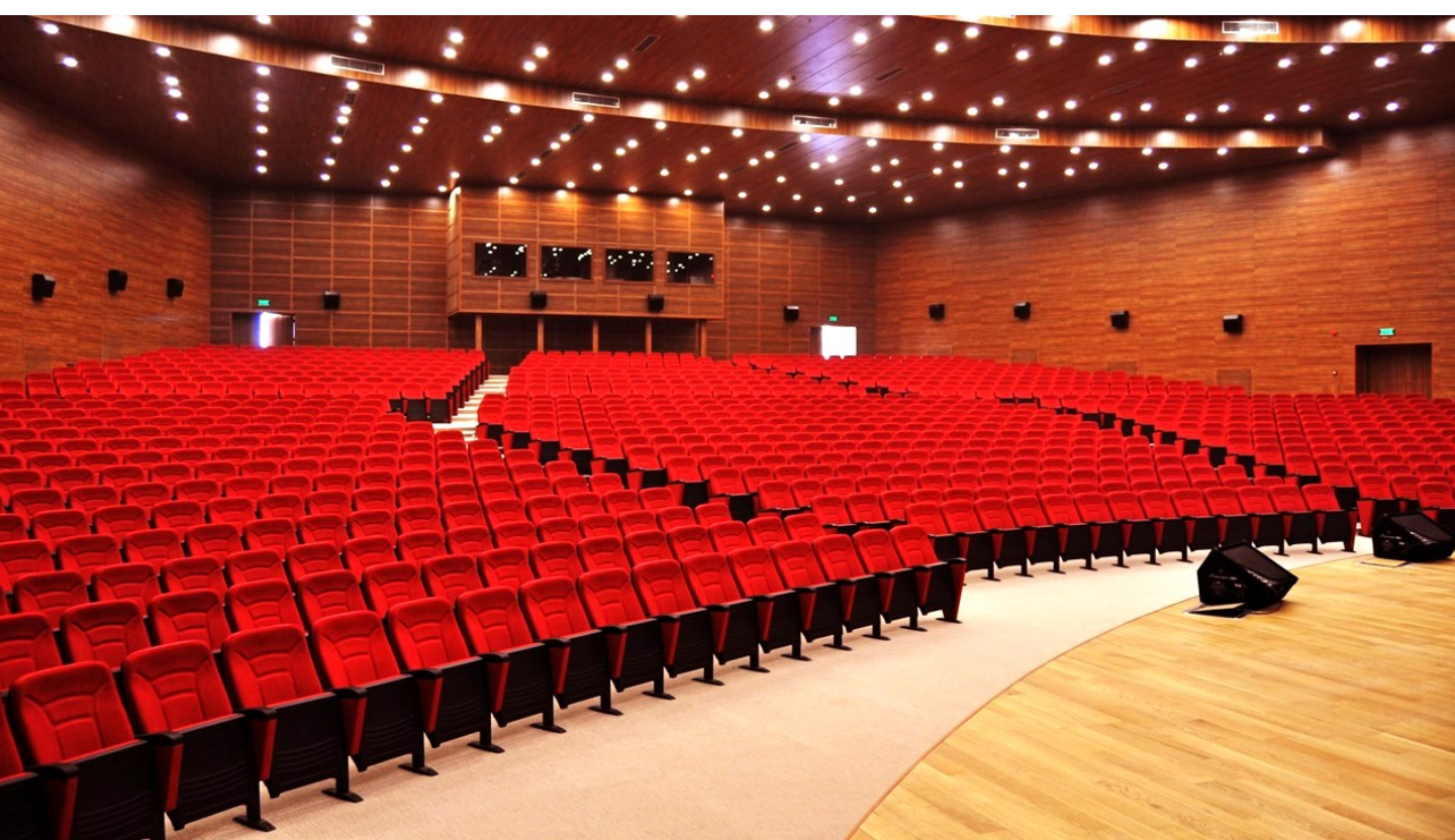
University of AKSARAY, Kayseri TURKEY Model of Seat: FLEX ; Number of Seat: 1.175 units; Year of development: 2013

The Flex is highly customizable, it is suitable for straight and radial layouts.